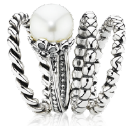
...to create your own combination of RINGS

Print out this page on A4 and place one of your rings against the circle. When the circle and the internal ring diameter match, you have found your correct ring size.