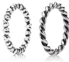
Combine with one or more matching styles