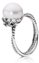
Choose your first RING