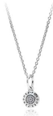
...to create your own NECKLACE