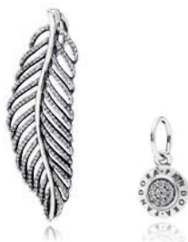
Combine with one or more PENDANTS