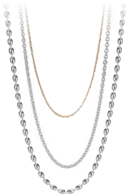
Choose a CHAIN