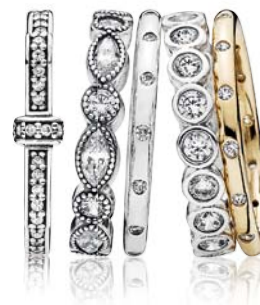
...to create your own combination of RINGS