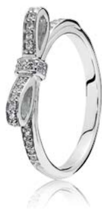
Choose your first RING