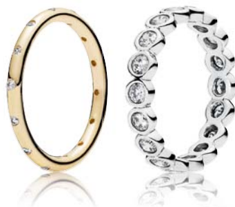
Combine with one or more matching styles